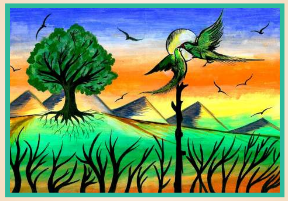
Art by - Pramod Sarvade Alumnus