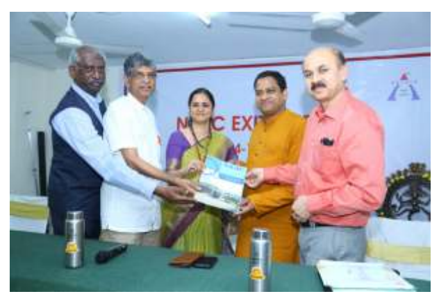
Aurora's Degree & PG College

The result of the assessment was finally out and the college was graded: B++