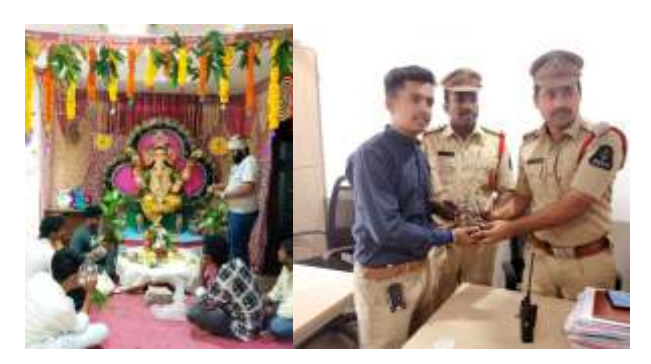
Aurora's Degree & PG College

Ganesh Utsav is one of the most celebrated